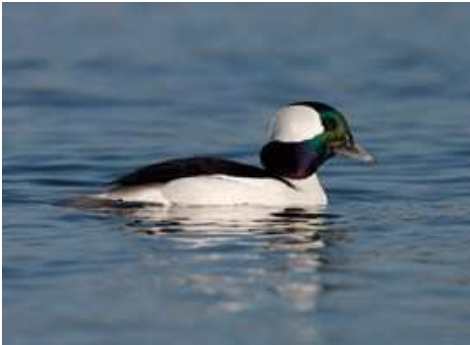
Bufflehead, male left, female right.

In addition to size and overall shape, color is one of the best ways to identify birds. So if you're interested in learning a few birds this month step out to both lakes and see how many white birds you can identify! These will, of course, be mixed with a variety of other non-white species. Some of these that we have observed in the past several weeks are the Double-crested Cormorant (a black bird often seen mixing with the pelicans, sitting low in the water and easily identified by their long, thin bills), Ring-necked Duck, Canada Goose, Ruddy Duck, and Mallard Duck. Until next issue...enjoy our white winter!