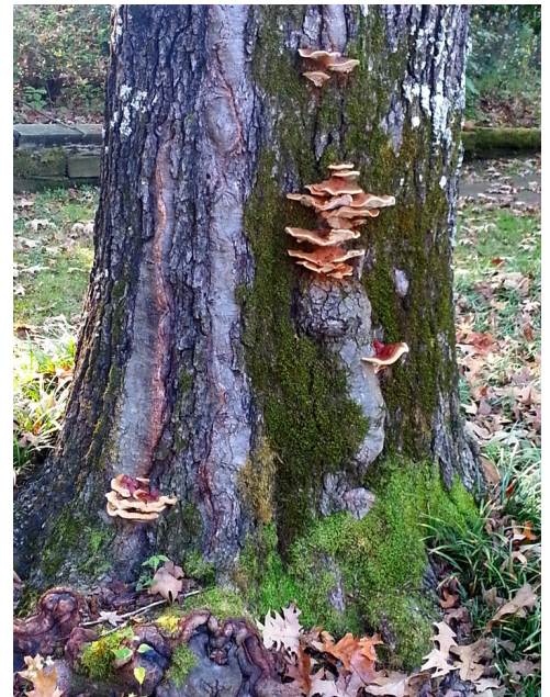
Fungus Ganoderma on Lakeshore Dr. tree