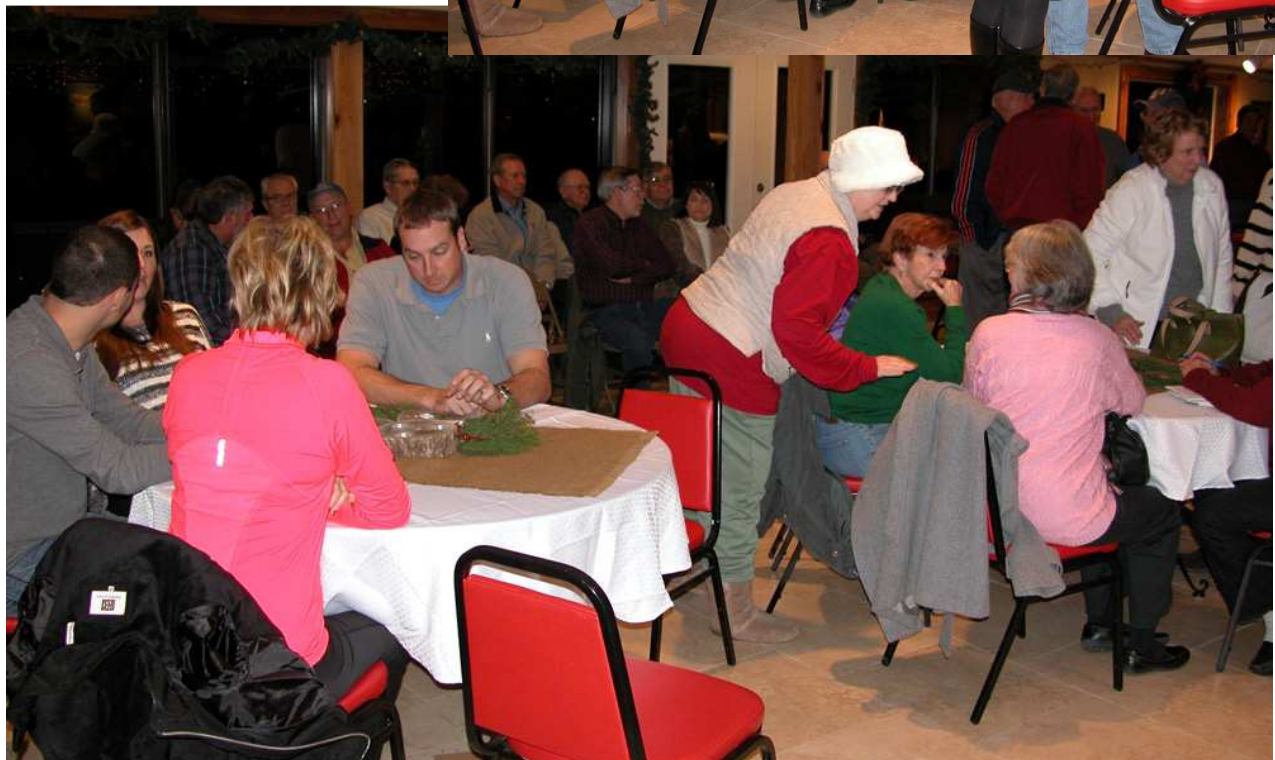
Annual Meeting – Lake Lorman Lot Owners Association