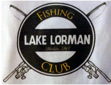
Front of T-shirt