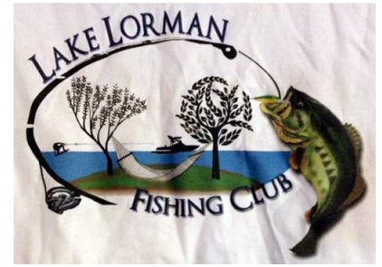
Back of T-shirt

T Shirts for sale – $20 Small, Medium, Large, Extra Large & Extra Extra Large Contact Margie Abel at 601-605-1772 or any Fishing Club member.